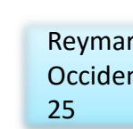
Reymark Daprosa Occidental Mindoro 25