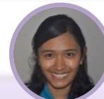
Jelaville Luarez Bulacao, Cebu City 21

As they embarked on PAFCOE's 10 th training session, may you take the burden to make mention of them in your prayers.