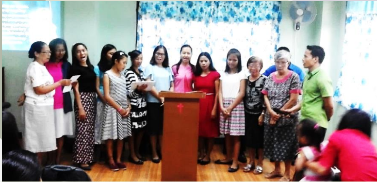
>>>Together with some PAFCOE staff members, the Manresa new-in-faith souls rendered their message in song during the AY Program at Damayan Lagi Church.

On the Sabbath of September 2, Manresa Adventist Church had their first ever church outing visitation at Damayan Lagi SDA Church.