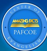
Photo Feature of the Month